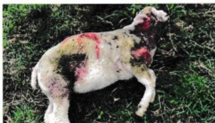
The result of a dog attack near Marlborough