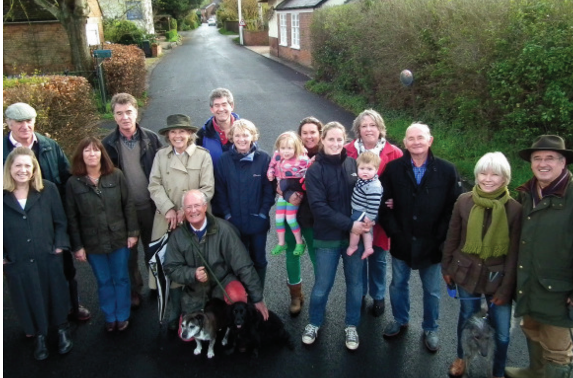
Enford Central & Littlecott