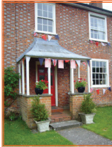
The Goulds Longstreet

A selection of some of the other houses where there was a sense of celebration.