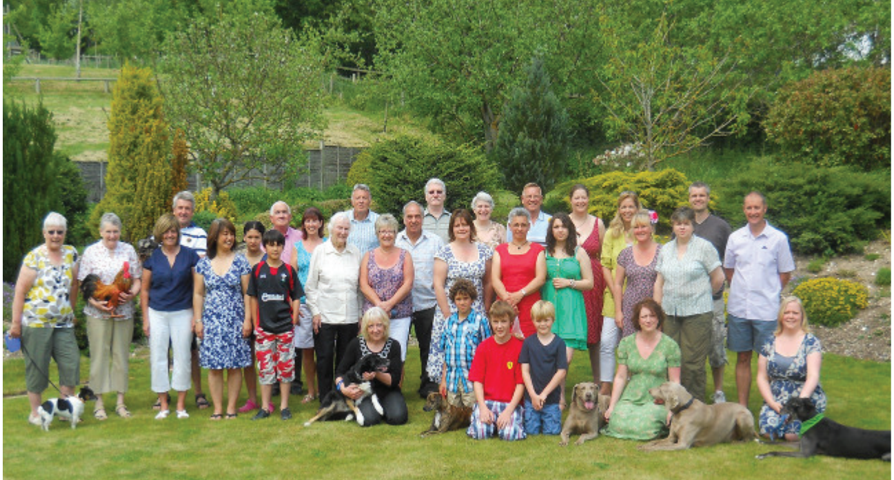
Coombe Lane, Coombe & Fifield