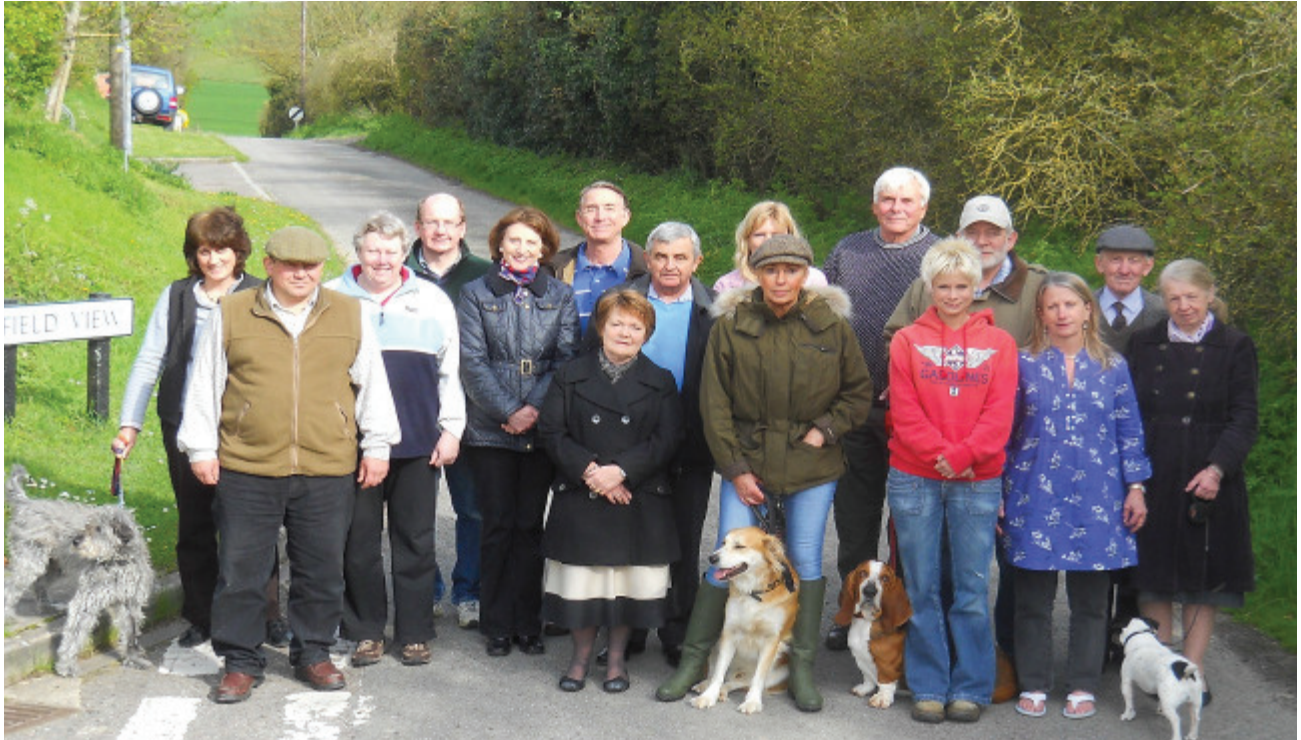
Water Lane (East), Palmerston Meadow & Field View