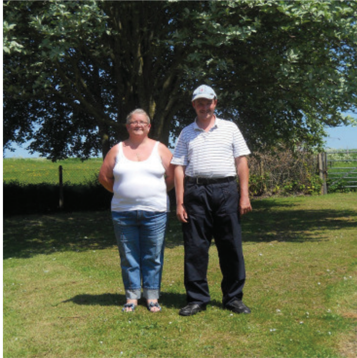
Paddock Close & Water Lane (West)