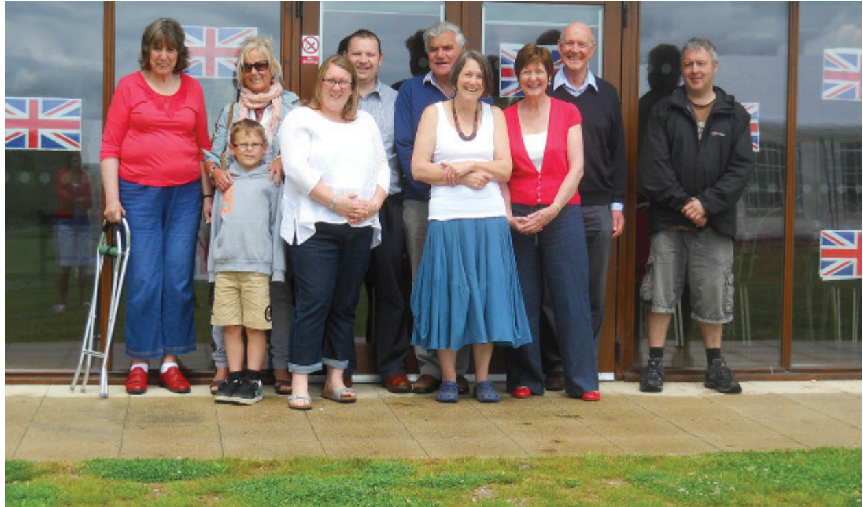
A few of the villagers outside the Village Hall