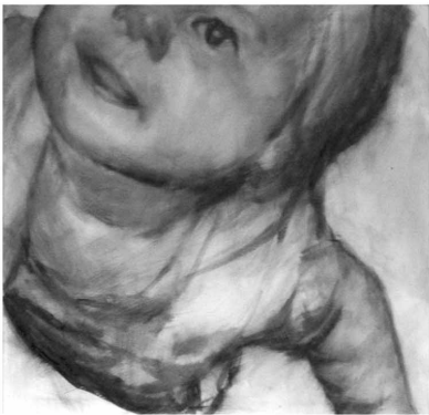
beautiful bespoke portraits...

All our art work is handpainted and affordable and we can work to your specification; whether you require a painting of a pet or a striking abstract to compliment an interior.