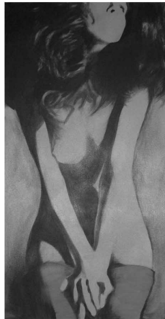
brilliant original art