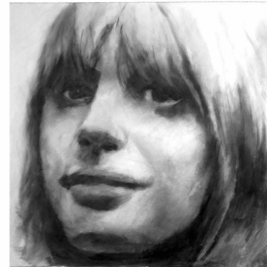
....any subject, any style!